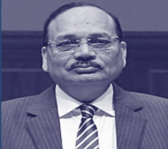
Justice Surya Kant Incoming Chief Justice of India